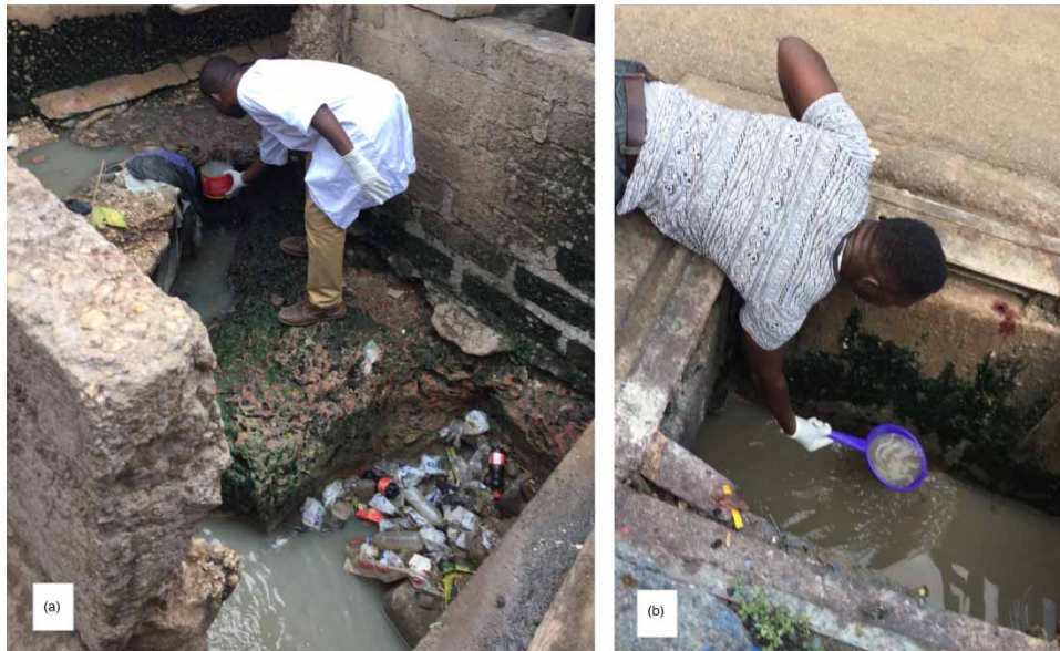
Figure 2 | Sampling site 1 (a), and site 3 (b).

at any sampling sites, including the two occupied by squatters. This is in contrast to what is reported from some urban slum neighbourhoods (Owusu & Afutu-Kotey 2010; Monney et al. 2013).